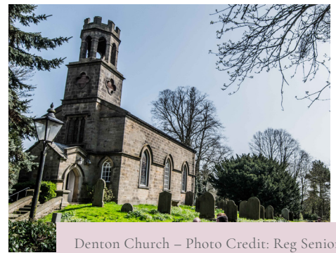
Denton Church