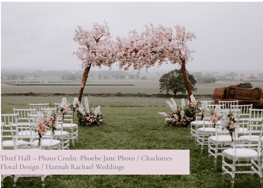
Thief Hall

This mini guide is designed to help you ask all the right questions while on the search for your dream wedding venue. You may find that not all of the questions below are relevant to your unique day, however I do hope this provides you with a useful list of key questions and things to consider.